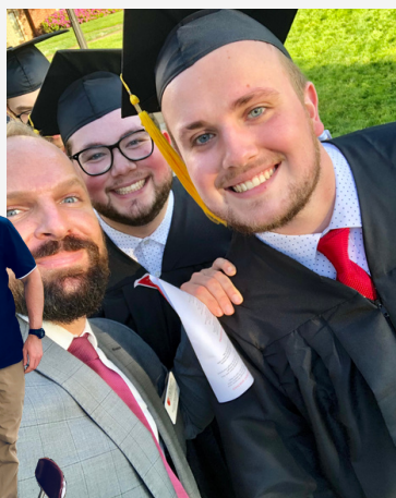
Now: Grove City College Graduation 2022