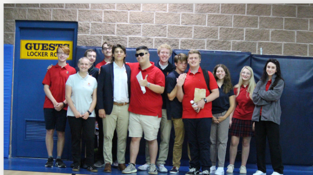
Cornerstone Prep Class of 2023