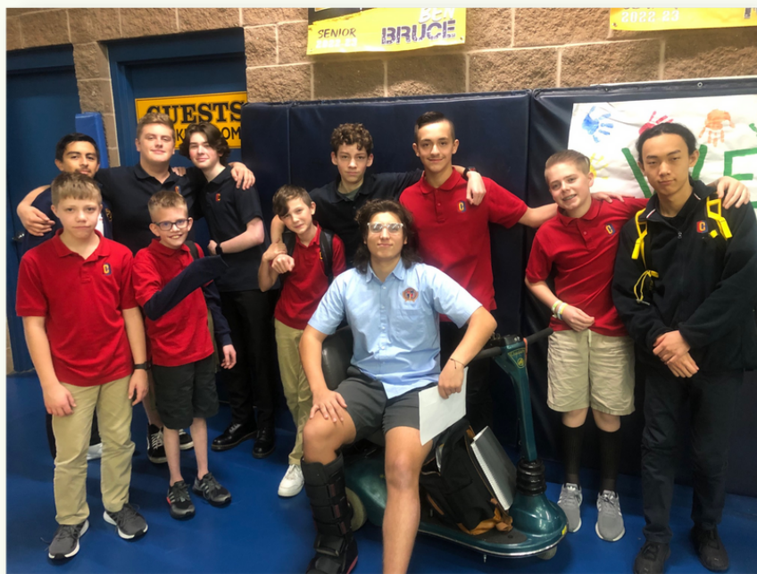
Cornerstone students gather for an assembly every morning and at weekly chapels and other special events.