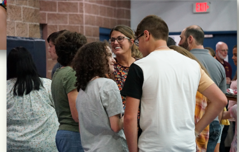
Teachers and administrators led breakout sessions to orient families to things like technology, mission, and ways to get involved.