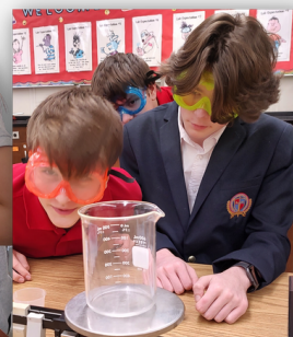
Authentic education is getting "hands on" to develop the kind of learning that matters for life and work in the real world.