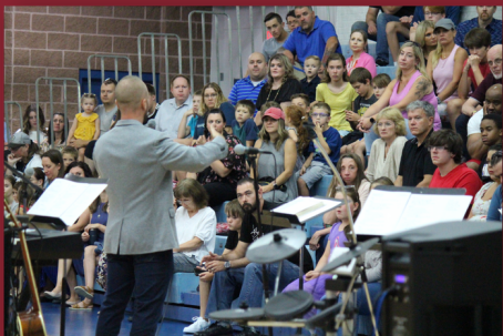
Opening messages to remind of the mission and vision of where we are heading.