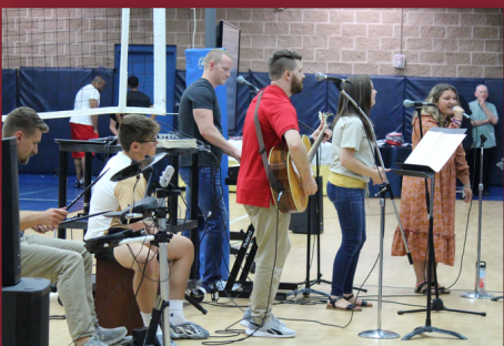
Worship. Praising Him for His faithfulness.