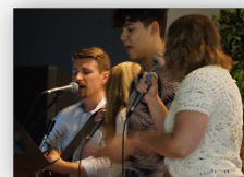
Every month, Cornerstone hosts an event for students and their families to gather for a meal followed by prayer and worship. The evenings have been well attended and, most importantly, Spirit-filled!